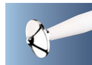
Large Exocervical #50114