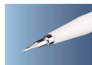
Soll Lash Epilating #50102