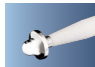
Special Exo/Endo #50111