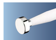
General Purpose* #50108