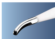
Curved Anorectal #50107