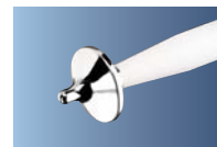
Jumbo Exo/Endo #50115