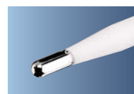
General Purpose* #50105