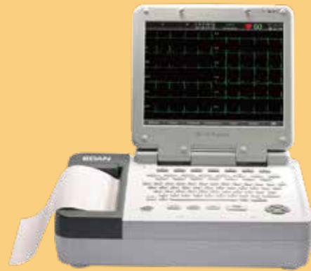
SE-12 Express Electrocardiograph